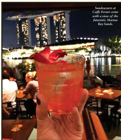
Sundowners at Caffe Fernet come with a view of the futuristic Marina Bay Sands.