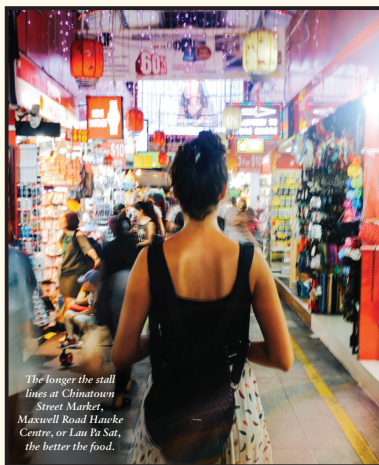
The longer the stall lines at Chinatown Street Market, Maxwell Road Hawker Centre, or Lau Pa Sat, the better the food.