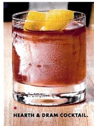
HEARTH & DRAM COCKTAIL.

This restaurant is the watering hole to write home about (or at least capture on social media). The handsome interiors—a modern take on the golden age of the railroad—are particularly apropos given that Union Station is only a block away. And in terms of a place to kill time, the bar makes a pretty sweet setup for a glass of Scotch and a plate of housemade charcuterie before your 5:45 p.m. train leaves the platform. hearthanddram.com .