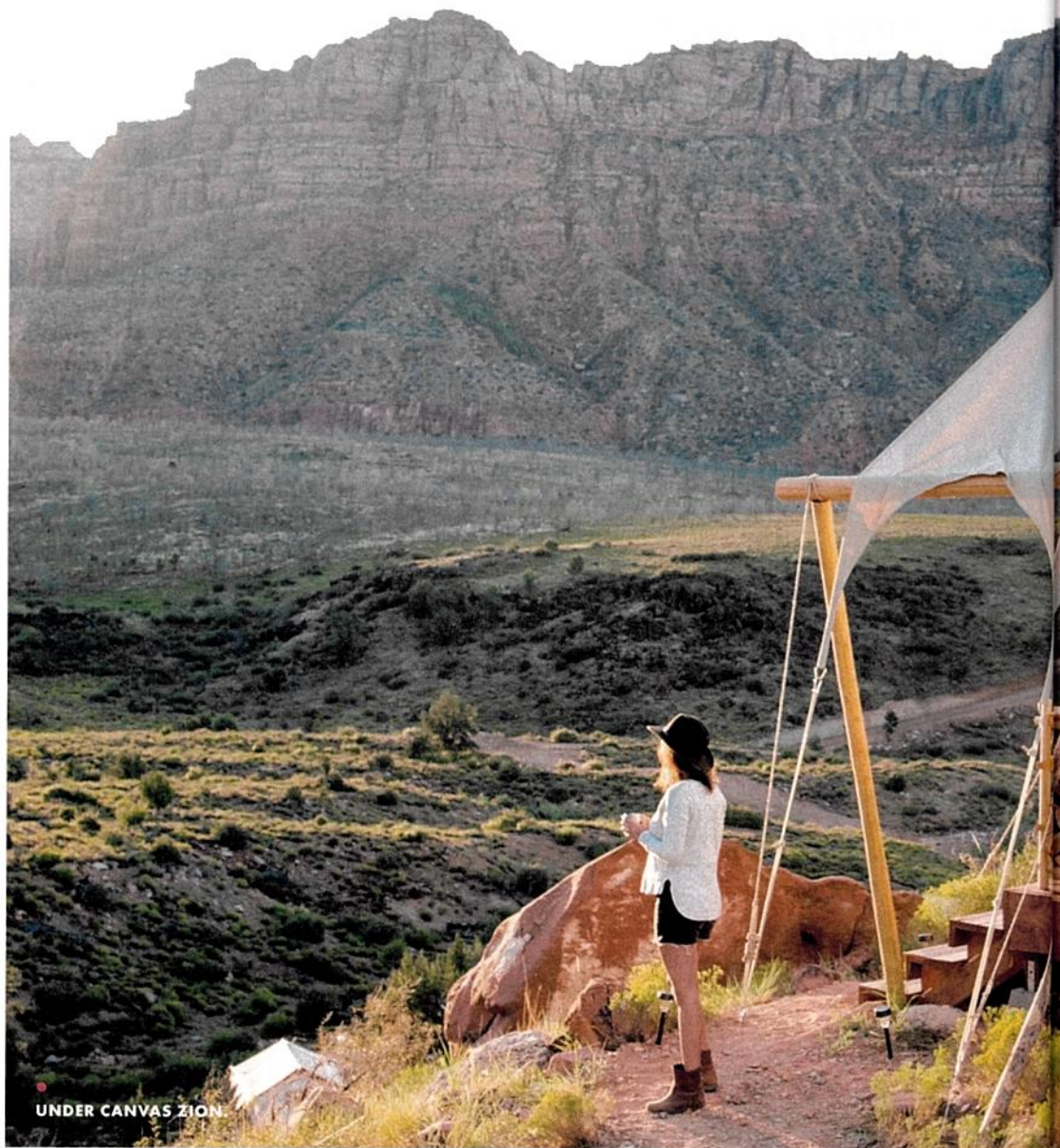
UNDER CANVAS ZION

A 1950s desert hideaway for Hollywood's elite, this Phoenix-area retreat re-opened last year after a long, meticulous reconstruction. Midcentury details laid the groundwork for design, with low-slung chairs, metallic accents, and bar carts worthy of a Mad Men tippie. The massive new wellness center features a stunning gym and moonlight rooftop yoga studio, as well as a pair of 75-foot pools with mountain views to enjoy with your post-workout smoothie. From $159; mountainshadows.com.