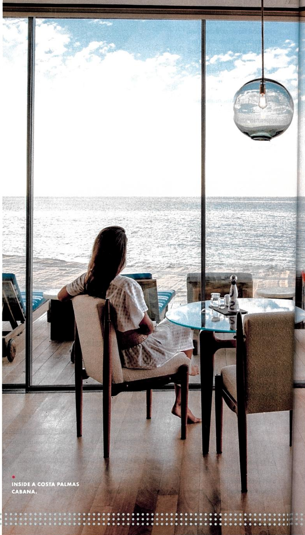
INSIDE A COSTA PALMAS CABANA.

Along a winding river about 40 miles west of The Broadmoor—a 100-year-old Italian Renaissance-style resort that just unveiled a pricey refresh—stands the historic hotel's unlikely offshoot: a seven-cabin fishing camp. Compared with the mansion's ornate furnishings and gilded details, the accommodations are humble, but the service is just as full (a chef is available to cook up the day's catch for dinner). Beginners do well with hands-on instruction, and seasoned pros will geek out over the Orvis gear and bevy of brown trout. From $1,005, all-inclusive; broadmoor.com .