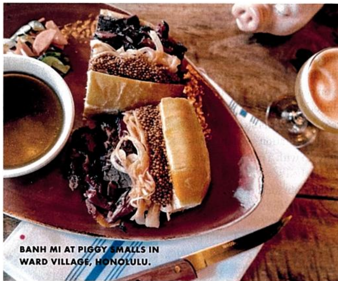
BANH MI AT PIGGY SMALLS IN WARD VILLAGE, HONOLULU.

Ventana Inn has been around since 1975, but when landslides blocked access to much of Big Sur in 2017, the resort's new owners took the opportunity to give the legendary property a multimillion-dollar facelift. The architecture still feels charmingly low-key: All 59 rooms and