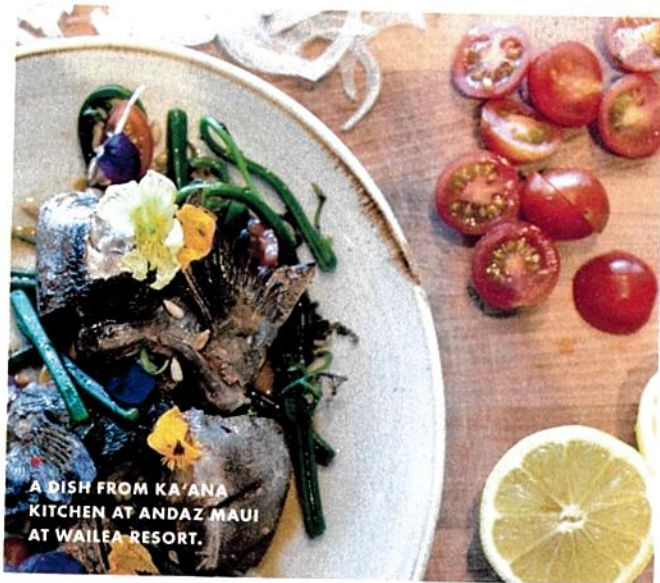
A DISH FROM KA'ANA KITCHEN AT ANDAZ MAUI AT WAILEA RESORT.

Unlike places that require a detailed itinerary to get the most out of a vacation, Santa Monica is best seen with no endpoint in mind. In fact, a daylong browse captures the area's laid-back spirit perfectly. Start at Third Street Promenade, where street performers play in front of retail draws like Madewell