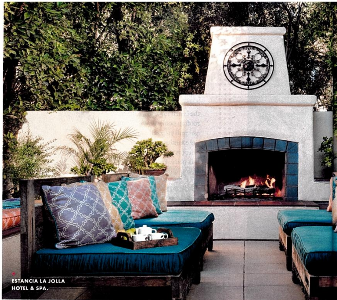
ESTANCIA LA JOLLA HOTEL & SPA.

Widely known for its wheat and sweet onions, Walla Walla is also gaining recognition for its 120 wineries and tasting rooms, many of which occupy restored early-20th-century buildings. Show up at Saffron Mediterranean Kitchen on any night of the week, and you may find it filled with young winemakers behind some of the best Cabernets and Syrahs in the country. Chefs have followed the grapes, and the combination